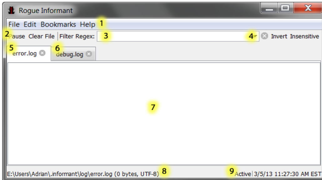
Figure 1. The main Informant interface.